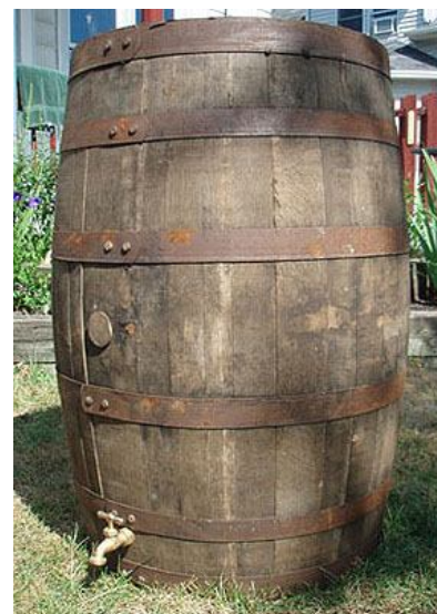
tunna = barrel