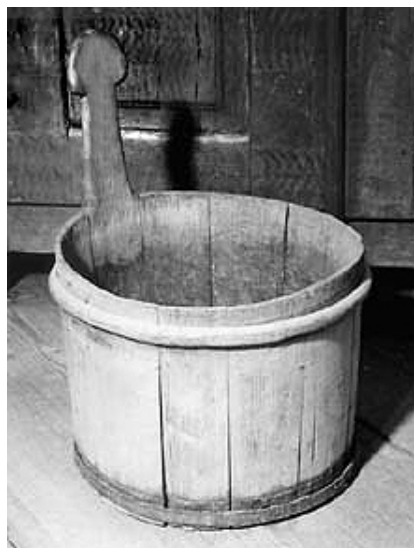
mjölkstäva = milk pail