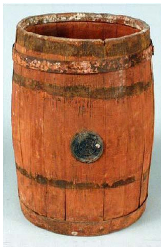
rödfärgs tunna = red ochre barrel