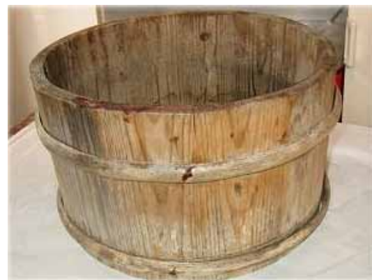
smorbytta = butter tub