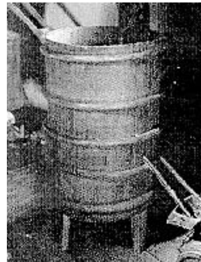
kyhlfat = cooling vessel