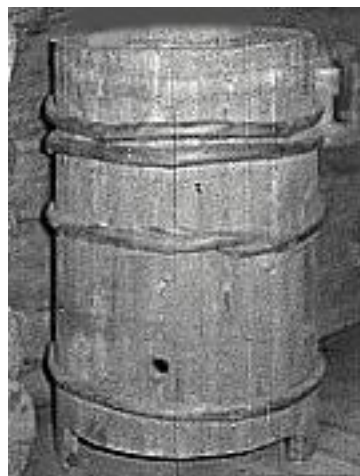
drickestunna = drink barrel