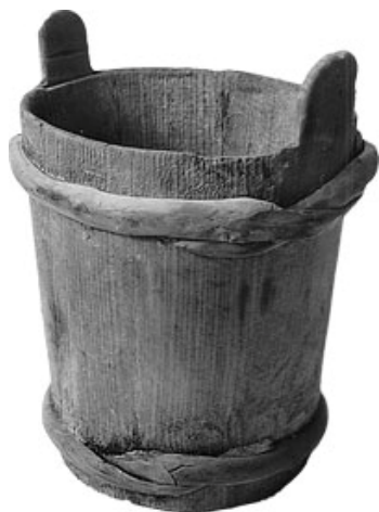
bytta = tub