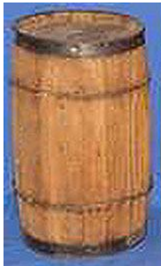
kagge = keg